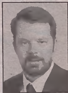
Judge Ray Warren

CHARLOTTE, NC — Ray Warren, a superior court judge in Charlotte, NC, and an openly gay Democrat, is considering a US Senate bid to fill the seat US Senate seat being vacated by Sen. Jesse Helms.