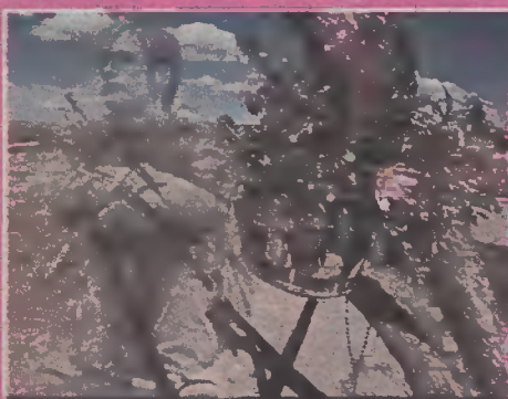
Remember Matthew Shepard

Published Every Two Weeks On Recycled Paper • Volume 16, Number 12 • October 27, 2001 • FREE