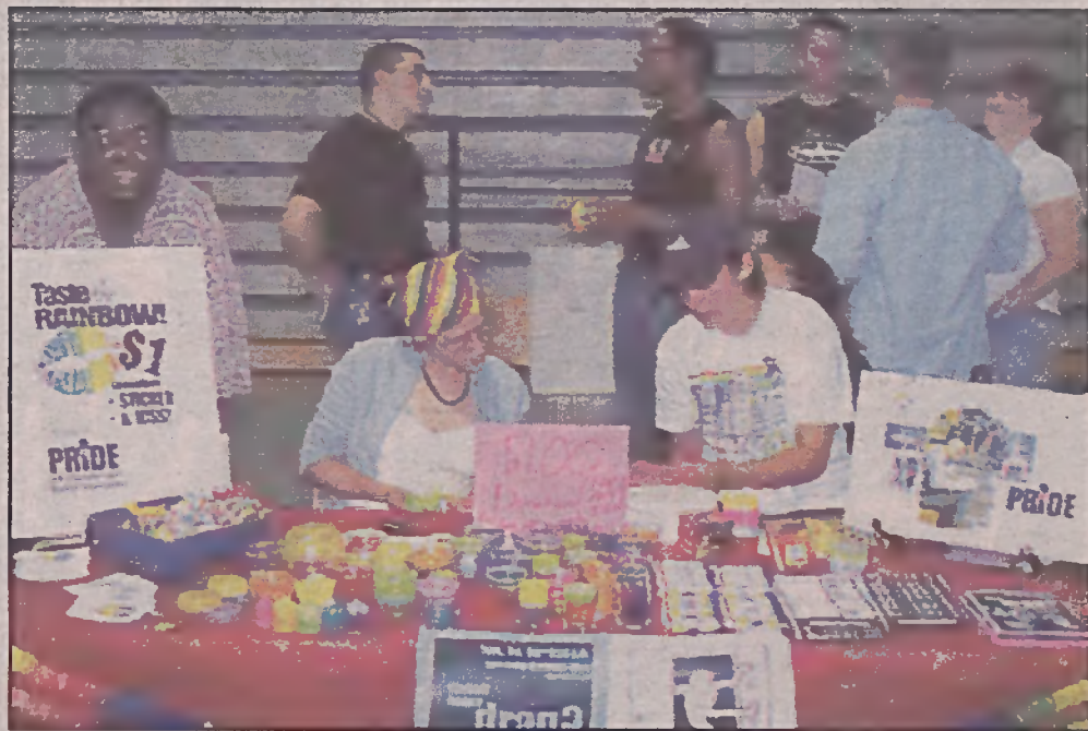
UNC Charlotte PRIDE attended the OutCharlotte Festival 2001, promoting their own PRIDE Week and National Coming Out Day events

As the week progressed, once again PRIDE opened doors and opened minds with a special program for National Coming Out Day. Media, students, and faculty alike heard testi-