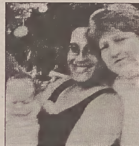
Happy Two Mothers Day

America's lesbian mothers have sacrificed and often suffered heartbreaking losses to keep their families intact. So the American Civil Liberties Union salutes them, as a shining