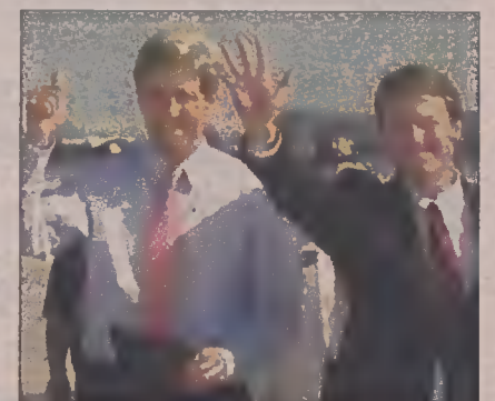
John Kerry (left) with John Edwards

"John Kerry and John Edwards make up the most gay-supportive national ticket in see GAY on 12