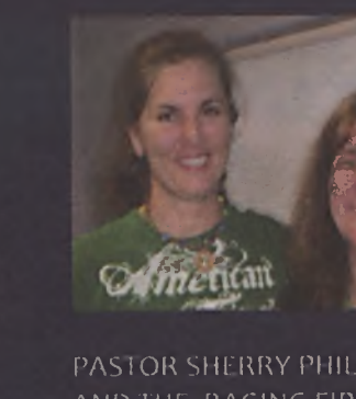
AND THE RAGING FIRE CHOIR

CONFERENCE HOTEL: QUALITY INN AND SUITES 1725 13TH AVE DR NW HICKORY NC 828-431-2100