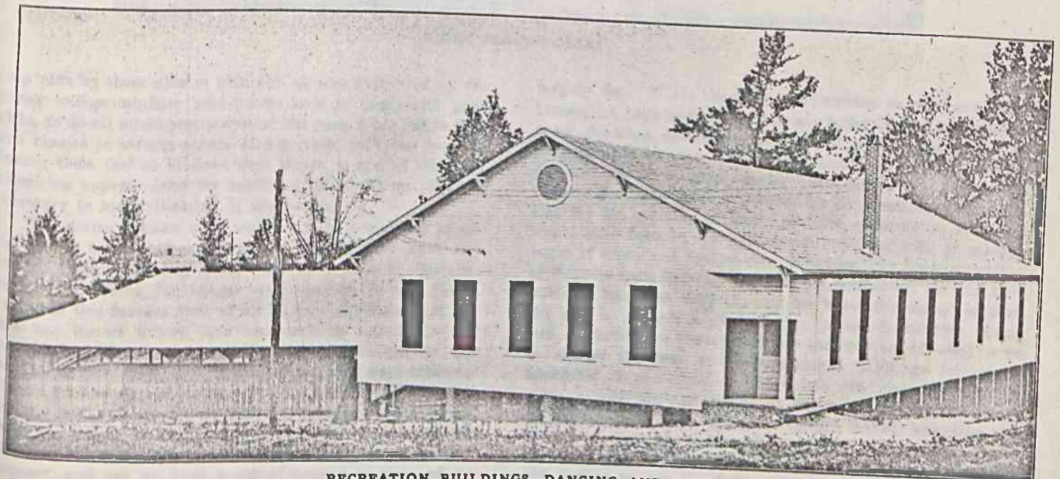
RECREATION BUILDINGS—DANCING AND POOL