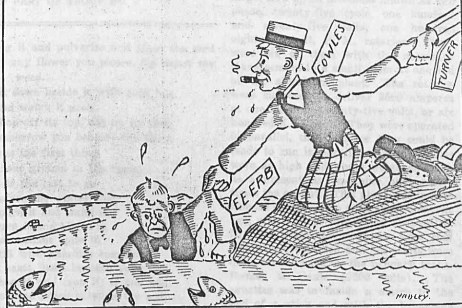
EVEN THE FISHES HAVE THEIR TIME TO LAUGH!