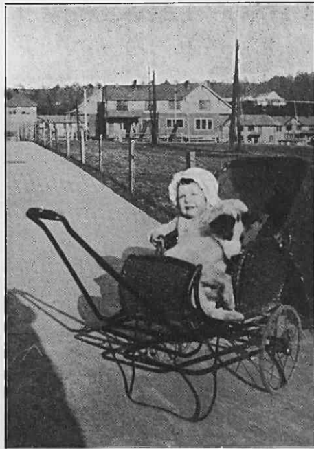
SOMETIMES TWO'S A CROWD

After a bully supper of "hot dogs," broiled steak, fried eggs, and roast potatoes, came the evening campfire, which the boys gathered around in a large semi-circle, listening to the jokes and yarns of the Scoutmaster. One of the best events was a continuous story, each boy leading the character in the story to a critical point—and the adven-