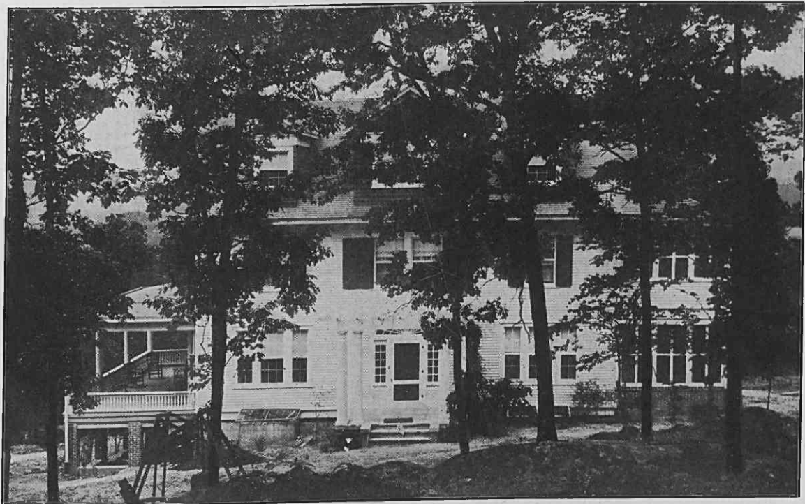
THE SUPERINTENDENT'S RESIDENCE