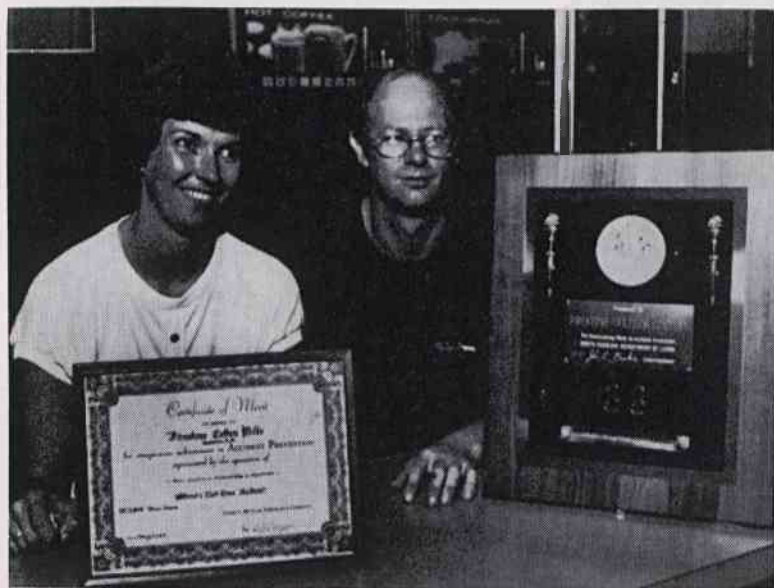
Today and 43 Years Ago ● Plaque, the 33rd consecutive one, symbolized the North Carolina Department of Labor award to Firestone-Gastonia people, the latest recognition for safety. Framed certificate is one of the earliest awards (this one from Liberty Mutual Insurance Company) to Firestone Cotton Mills of Gastonia in May, 1937. It recorded 1,672,800 people-on-the-job hours without a lost-time accident, from Oct. 22, 1936 to April 17, 1937.

Bumper stickers seen along the way ● REPEAL INHIBITION! And LEGALIZE BLUEGRASS!