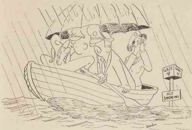
I NOT ONLY RECOMMEND... I DEMAND THE AIRPORT COMMISSION BE NOTIFIED IMMEDIATELY CONCERNING THIS RAMP DRAINAGE PROBLEM...