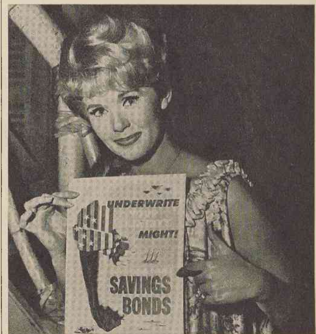
Underwrite your country, says Connie Stevens, and buy U. S. Savings Bonds.