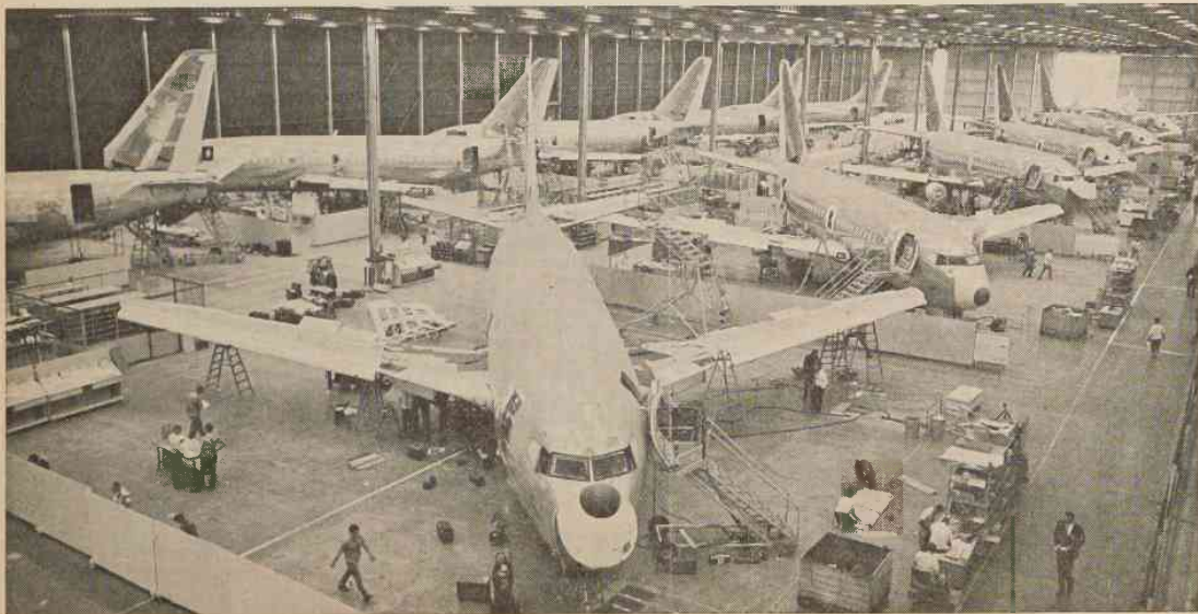
FINAL ASSEMBLY FILLED with 737s. Though Piedmont's first 737 has not yet reached the final assembly building at Boeing's Seattle plant, it won't be long! Meanwhile, this picture shows how the newest jets are shaping up.