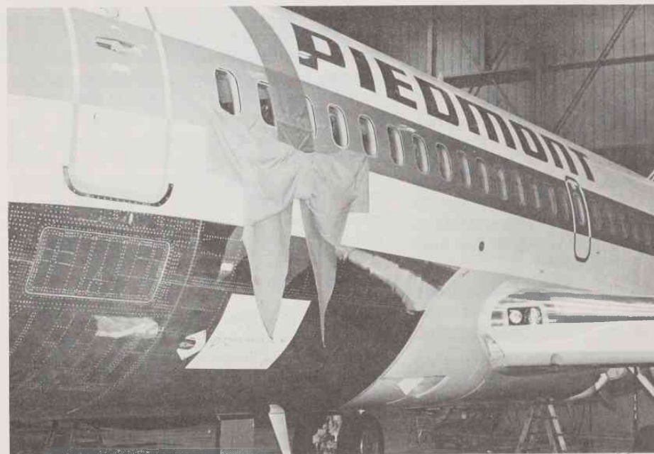
The Winston maintenance and stores employees produced their own version of Santa's sleigh just in time for the final holidays of 1979. The modification of aircraft 775N had to be completed in order to get the plane into service before year-end. Since it didn't even arrive until December 21st, rush was the only word

If you want a gift delivered in a novel way or want to send a singing message, check with your talented flight attendants.