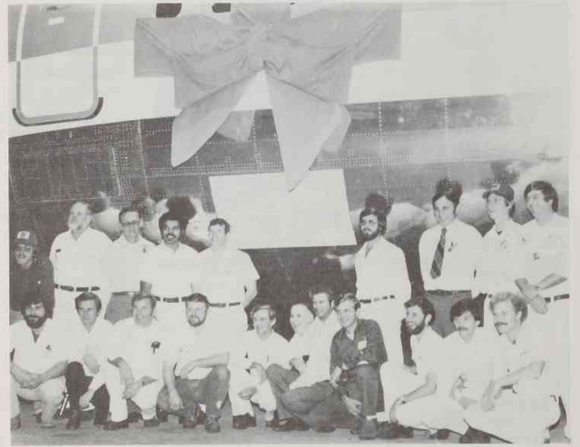
for the job. Work started almost as soon as the plane touched down. On Christmas Eve, 775N was rolled out, complete with red bow and a We Care tag signed by the men who managed to produce the holiday miracle. Some of the many who made it all possible are pictured above with their present to Piedmont. Standing