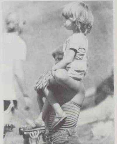
The events enthralled spectators of all ages. If you had to share the binoculars a shoulder seat helped.