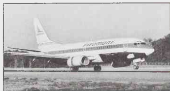
B737 twinjets will be operated on the new LAX flights.

The Piedmont Shuttle Link, operated by USAir Group subsidiary Henson Airlines, will also expand service in various Florida markets during March.