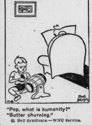
"Pop, what is humanity?" "Butter churning."