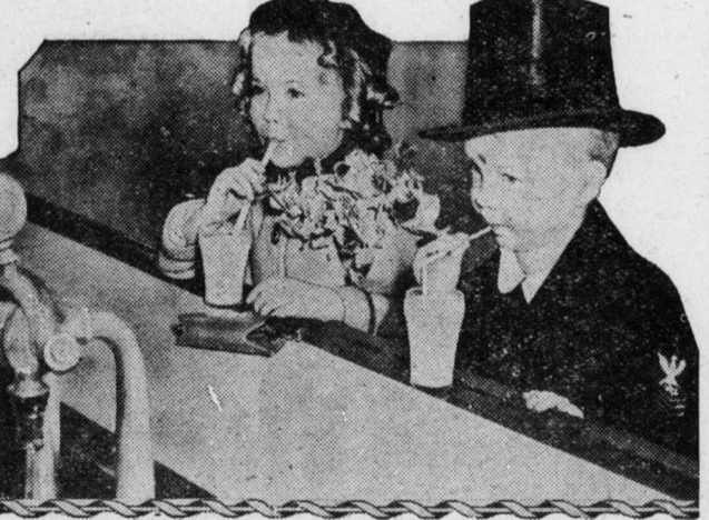
HERE'S food for the scandal columnists! Baby Leroy and Shirley Temple, the little movie stars whose weekly salaries come in four figures, were spotted on their first "date" when they stopped for a milk on their way to the theater in Hollywood.