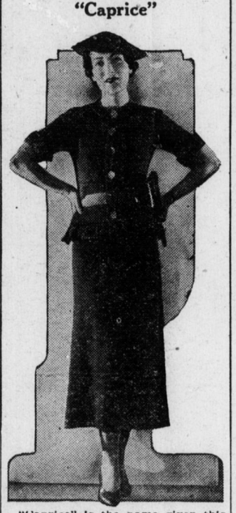
"Caprice" is the name given this two piece hand-knitted dress by its designer, Anny Blatt of Paris. It is in mouse color with belt and buttons of yellow leather.

Salmon Sandwiches. Add a sour, chopped pickle to two or three tablespoonfuls of flaked salmon mixed with salad dressing. Spread on buttered bread and serve with a hot or cold drink.