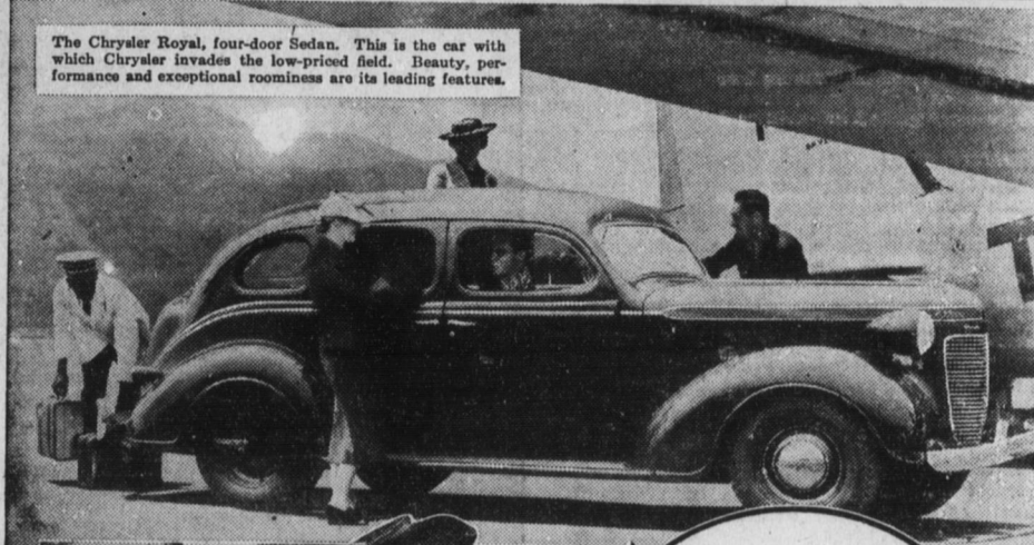
The Chrysler Royal, four-door Sedan. This is the car with which Chrysler invades the low-priced field. Beauty, performance and exceptional roominess are its leading features.