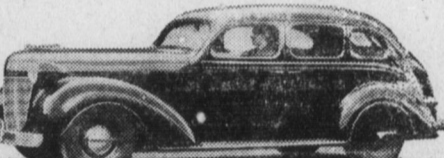
The Chrysler Imperial, 204 inches overall and 110 horsepower. This car is a larger and more luxurious model on the same general lines as the Royal.