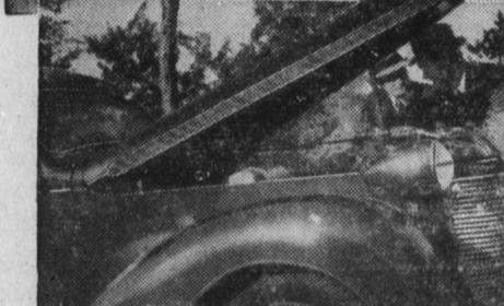
The hood of Chrysler Royals and Imperials are hinged at the back, enabling them to be raised from the front to give easy access to the engine.