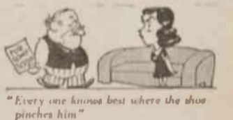
"Every one knows best where the shoe pinches him"

While the Bulldogs were winning at baseball the tennis team also played at E. C. T. C., and came away with a 4-3 victory. This was close yet it nevertheless was a victory and I might add, the first of the season. The tennis boys have worked and tried hard all season and now they have finally been rewarded by a close and hard-fought but the final decision was in favor of A. C. C. The tennis team meets the netters from E. C. T. C. again on Tuesday of next week.