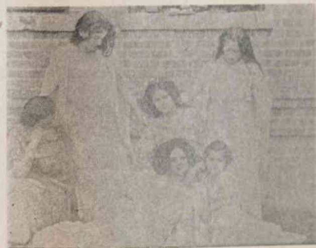
Expression Club—Pine Knot 1910