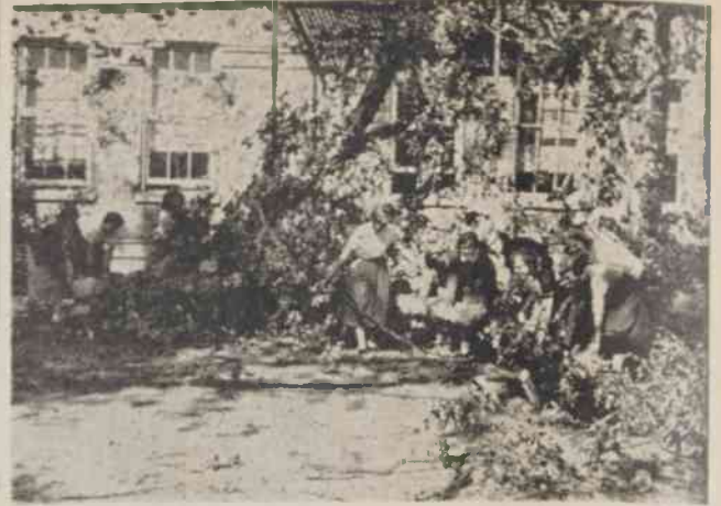
Physical Education Class Comes To Rescue