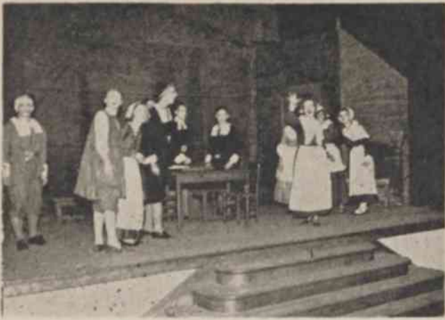
The Crucible. An Unforgettable Play