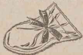
Midnight Powder Mitt filled with Midnight Dusting Powder... $1.25