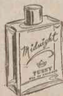
Midnight Eau de Cologne light, long-lasting $1.50