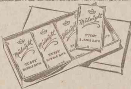
Midnight Bubble Bath... 16 packets of bath-time luxury... $1

She loves the fragrance... she loves the blue-and-gold packages... and she'll adore the Santa who gives her several!