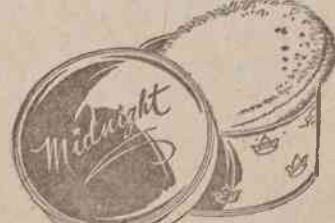
Midnight Dusting Powder with lamb's wool puff... $1.50