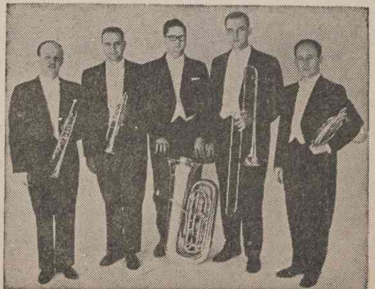
THE NEW YORK BRASS QUINTET will perform at Fike High School on Sunday, February 23 at 3:30. Its members are all graduates of Juilliard School of Music.