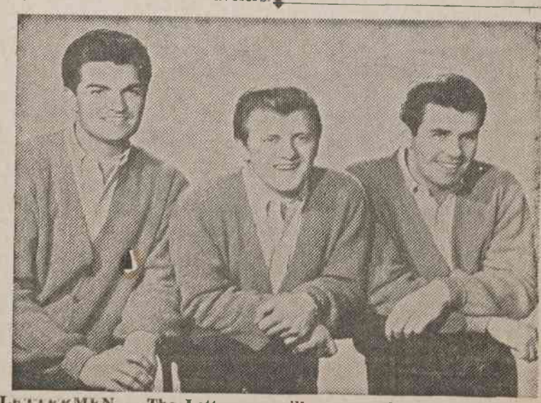
The Lettermen will appear Thursday, March 5, at LETTERMEN eight o'clock P.M. in Wilson Gymnasium on campus. presently being sold by various members of the Co-Operative Association. The Lettermen are being jointly sponsored by The Co-Operative Association and The Concert and Assembly Committee. Tickets are being sold for seventy-five cents.

The final performance of Stage and Script's presentation of the famous British mystery "Night Must Fall", will be held tonight in Howard Chapel. This play is one of the most famous psychological murcess. The play is being directed by in their style.