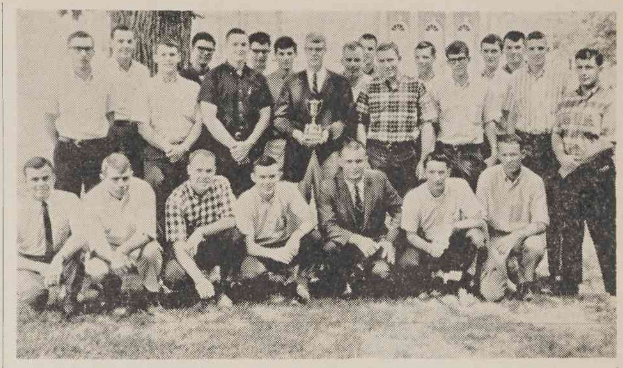
INTRAMURAL CHAMPS — Shown above is Sigma Phi Epsilon Fraternity, winner of the intramural championship trophy. The group compiled a total of 681 points. The trophy was presented during the annual awards day program last Tuesday.

sisting of songs popular during the Omega Chi, softball. period.