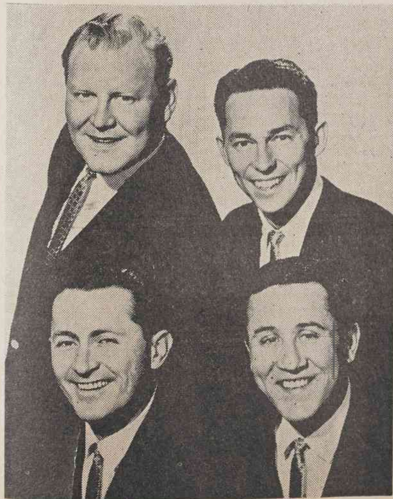
THE FOUR FRESHMEN will appear on the Atlantic Christian College campus on Sept. 29. The group will perform in the gymnasium. Tickets will cost students $1. Charge to non-students will be $2.

REGISTRATION DAY IS TOUGH for students and teachers alike. The usual long line formed in front of the Administration Building. The youngster pictured above was not attempting to register for the class of '81, but was waiting patiently for his mom to hold his pop's place in line while he made housing arrangements in town.