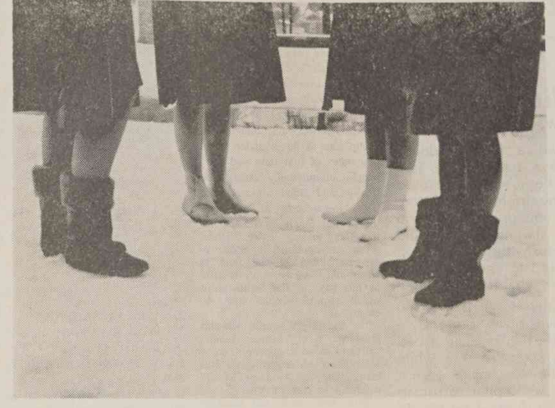
BOOTS, BOOTS, BOOTS—This was a very common sence on ACC's campus this week as the heavy snow of last week began to melt and turn to slush. Such footwear does much to draw attention to the pretty coeds of ACC.