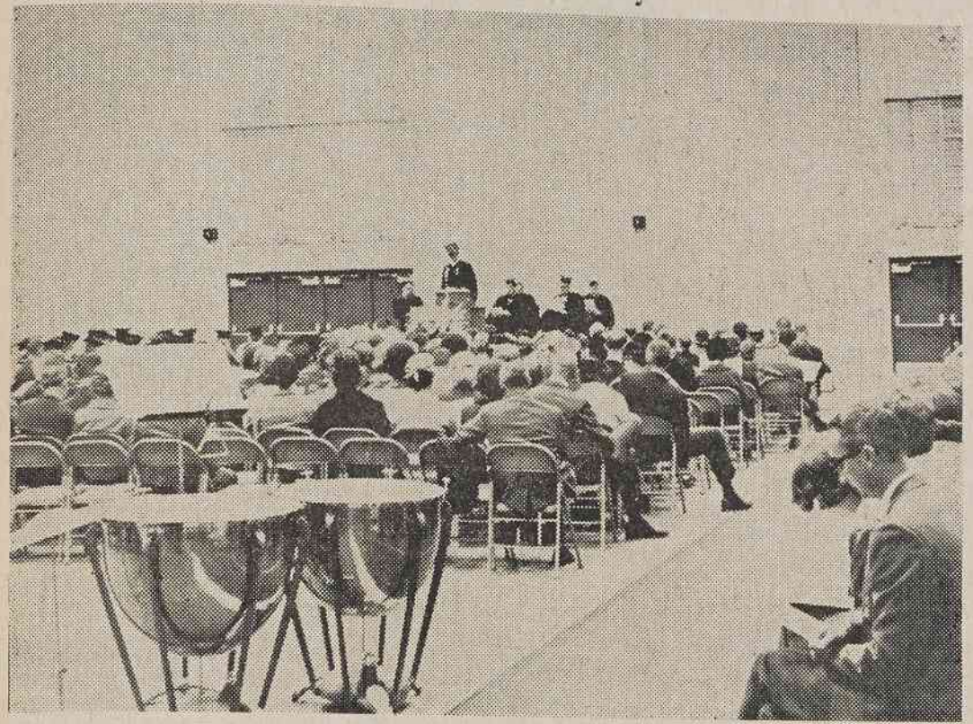
SEVERAL HUNDRED PERSONS-Were present Nov. 5 for the dedication of ACC's three newest buildings. The dedication ceremony was just one of the events of this year's homecoming. For pictures of other events turn to pages 4 and 5.