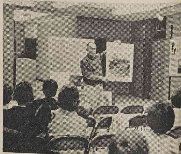
WHAT AM I BID? This call resulted in gaining several hundred dollars at the third annual Art Department Auction to the auction is over the CRUCIBLE is still on sale in the classroom building. The price is only one dollar.