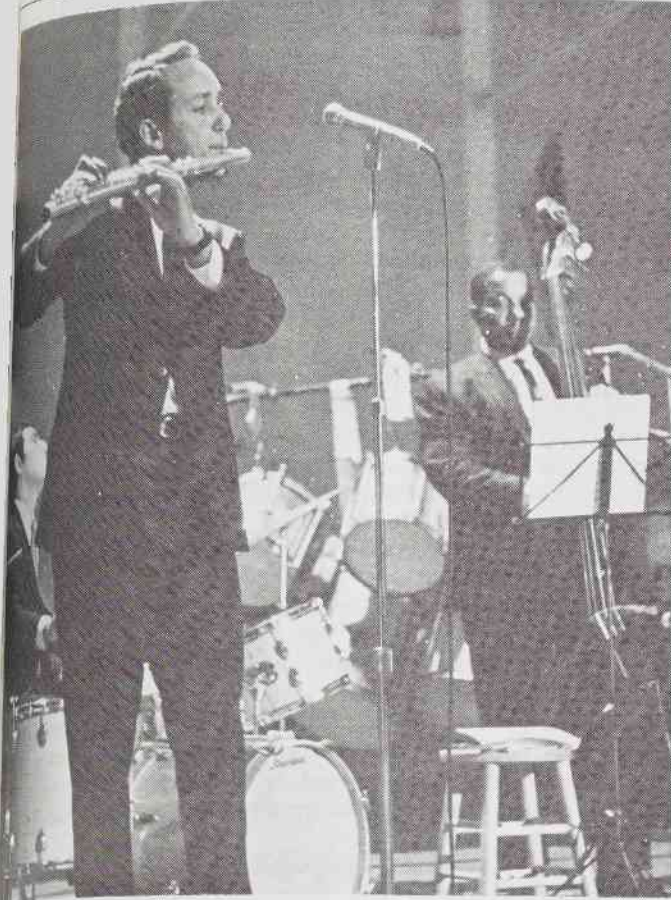
Students attending the Paul Winter Instrumental Group concert Friday night were treated to an interesting adventure in the musical tradition of the Bossa Nova, intermixed with jazz and folk music. Praises are still being heard across campus from those few who attended the concert.

The development program includes plans for a new library, provision for expansion of the campus, and improvements on existing buildings. The money will also provide for the retirement of outstanding obligations.