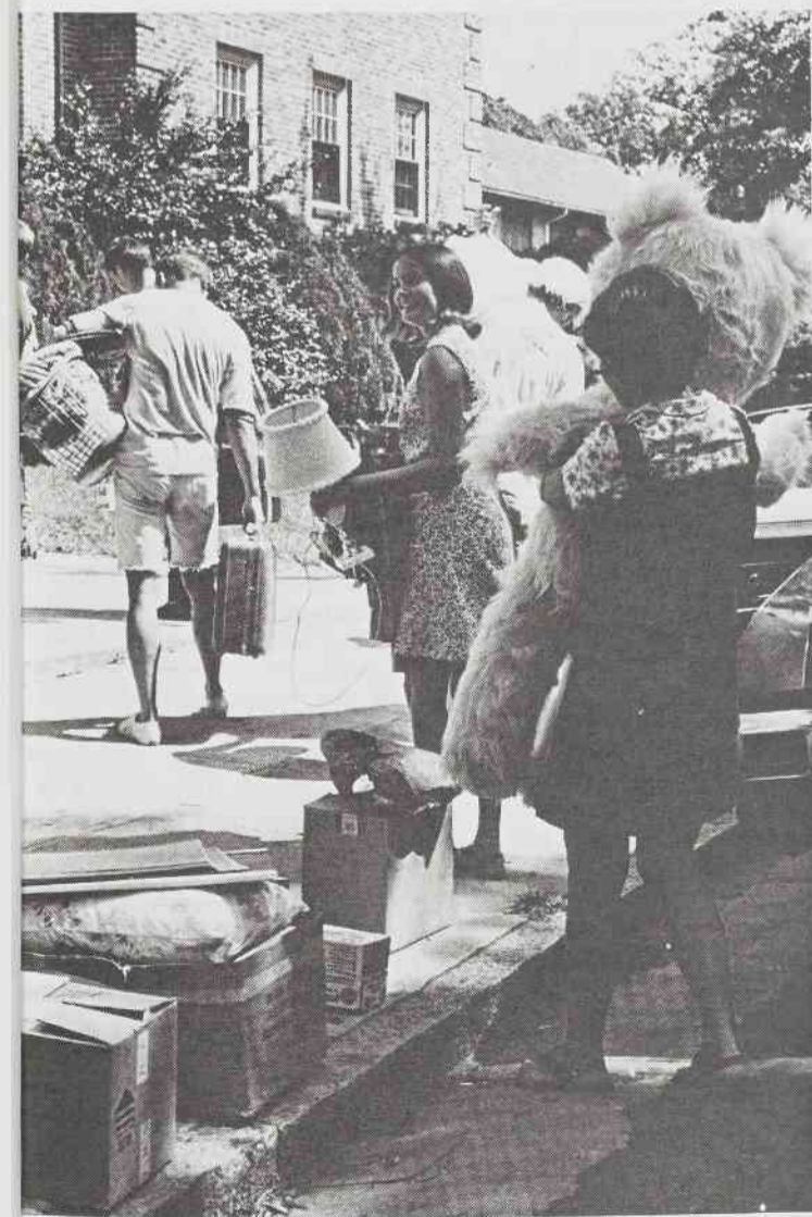
New girls at ACC quickly learn who the campus suckers are by strewing their belongings along the curb asking every boy they see to tote about four thousand pounds of junk up to the third floor. Carry your teddy bear, honey?

C. L. HARDY LIBRARY ATLANTIC CHRISTIAN COLLEGE