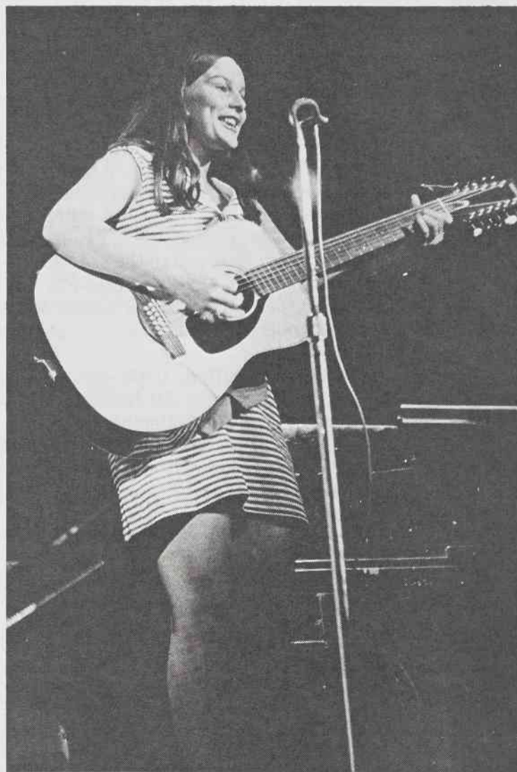
A Monday-night talent show lightened orientation for the frosh, and as usual at least one aspiring young Joan Baez brought the house down.

Among Billy Steward's greatest hits are "Summertime", "I Do Love You", "Fat Boy", "Cross My Heart" and "Sitting in the Park".