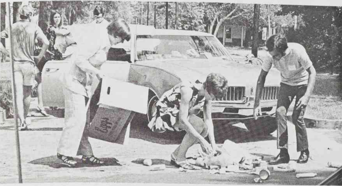
Alot of help this upperclassman was to the already confused and bewildered freshman...but you might as well start the year of with a bang.