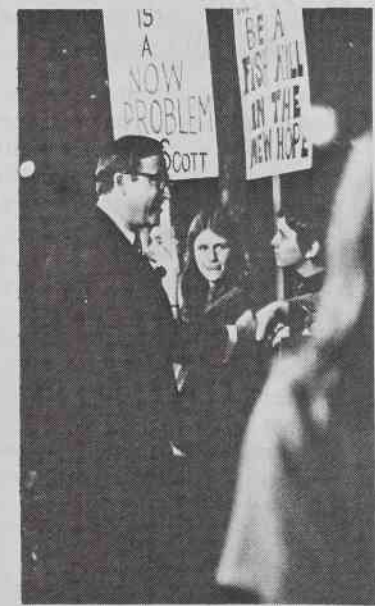
Governor Bob Scott spoke to a gathering of demonstrators Friday night outside the Student Center. Scott spoke to the students on the subject of ecology. Although the demonstration was a peaceful one news coverage deemed it differently.