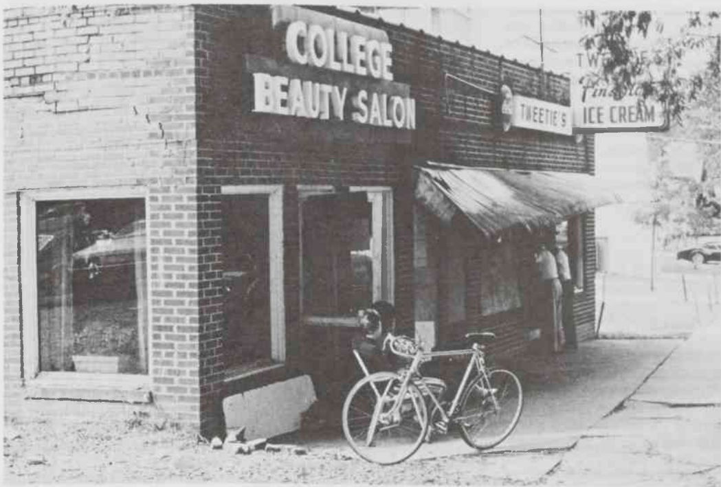
This is the result of the fire which struck Tweetie's Sunday morning.