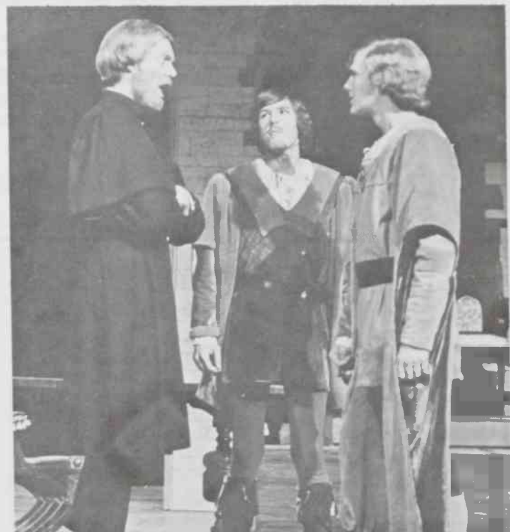
Stage and Script will open tonight with "The Lion In Winter." Curtain is at 8:00. The show will continue through Saturday, October 9th.