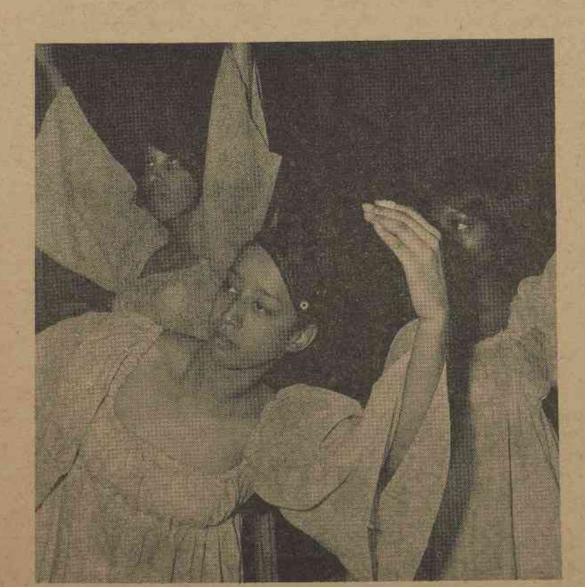
The Modern Dance Group in "The Masquerade"