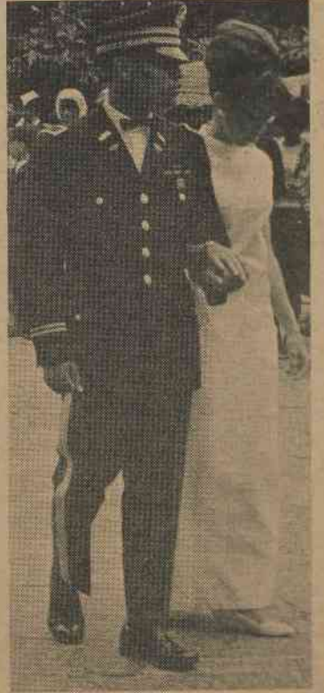
Strolling In Beauty