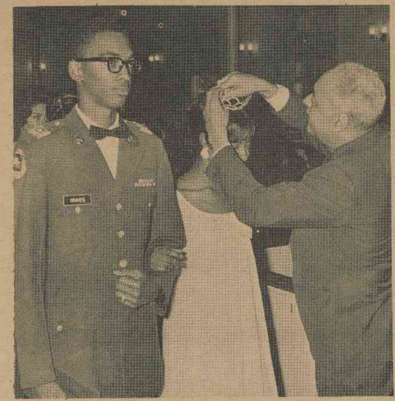
The crowning of the May Day Queen

The raindrops served only to enhance her regal beauty. Such was the case May 4 when Ben-