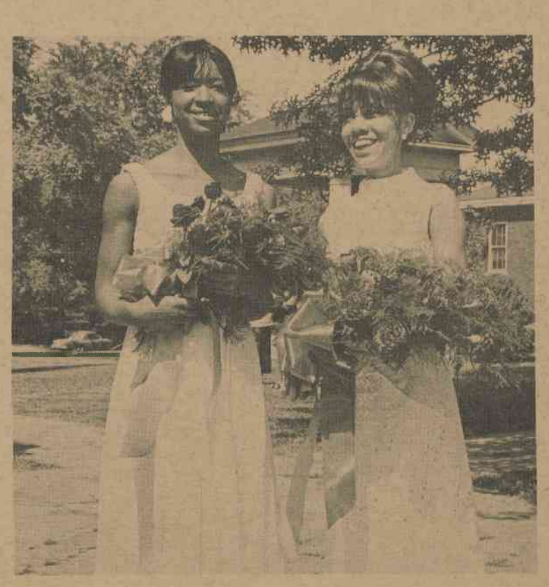
The Queen and her first attendant