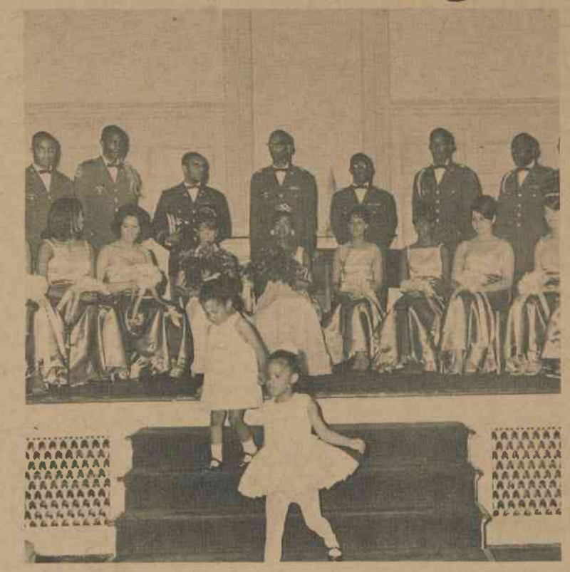
Neither rain, nor snow, nor the gloom of night could stop the May Day Procession.

The program was truly a trib-ute to spring. There was only one slight disappointment, however, the annual May pole Dance was terminated.