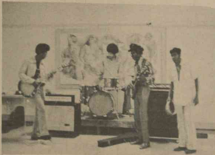
Jazz band from Dudley High School entertains students during Link workshop