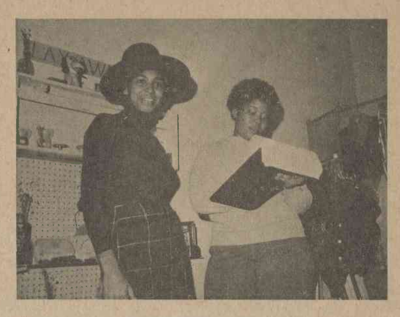
Senior Clothing Majors at the Boutique