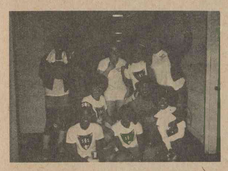
Swings Pictured After Their Victory

The staff of '72-'73 wishes you much success and we hope that the faculty, staff, and students will continue to support the Banner Staff.