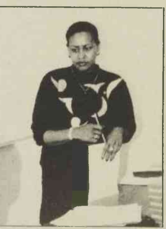
by Deanne McLeod MCKISSICK-KEMP: Towards black empowerment.

Dame proved quite a formidable challenge.