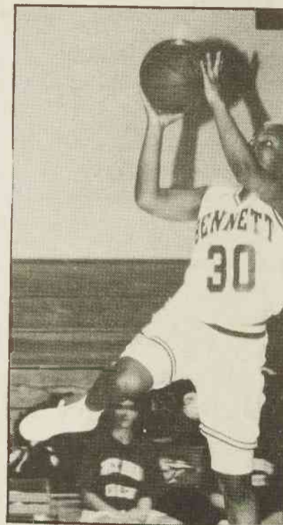
Trouble shooter of the year

The Belles' hardwood season is coming to an end. With a team full of underclasswomen, the Belles should have successful seasons in the future.