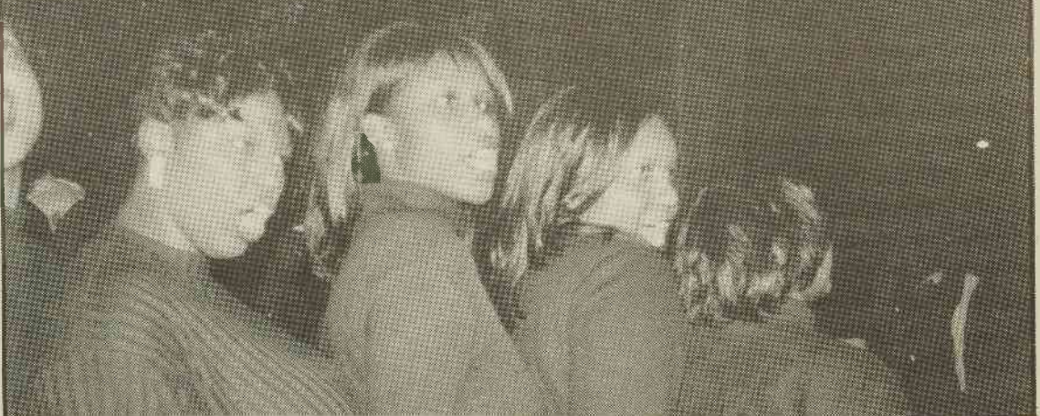
The ladies of Alpha Kappa Alpha Sorority, Inc. sing during their introduction to Bennett College as new members of the Zeta Xi Chapter in November.