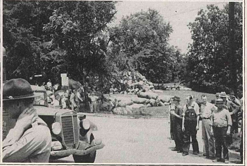
The flood of August 14 caused considerable damage and stirring about on the part of the Company when advancing waters made it necessary to move raw stocks of cotton and wool from Company warehouses. Top, left photo shows wool and cotton spread out in the sun at the main plant after removal from the partly flooded old shoe factory building. Top right was made after work of cleaning up the stock had begun. Lower left photo shows activity on East Main street in front of the Chatham warehouse there as wool was moved from the building to be piled on high ground (lower right), near the home of Mrs. Rich Chatham. Mr. Thurmond Chatham may be seen standing in center foreground of lower left photo as he talks with an employee.