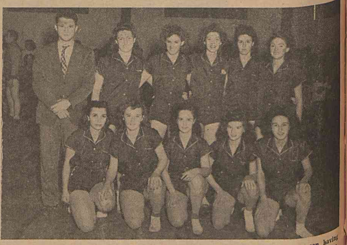
Ecusta's outstanding girls' basketball team has won all five of the games played this season, baving above

received a nice Certificate of Merit for having completed the contest without a lost-time accident.