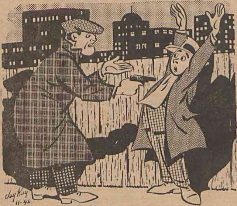
"QUIT BEEFING, BUB. YOU COULD CARRY INSURANCE TO COVER DEES THINGS."