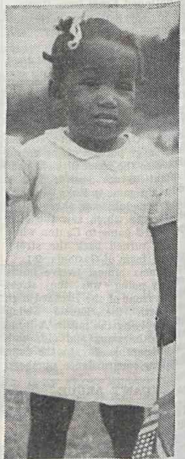
SHE GOT TIRED