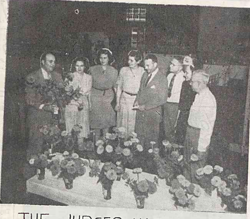
THE JUDGES HAD A JOB.