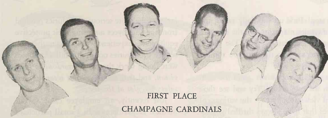
FIRST PLACE CHAMPAGNE CARDINALS

The Champagne Cardinals copped the Ecusta Inter-departmental Bowling League crown for the 1948-'49 season with a record of 46 wins against 20 losses.