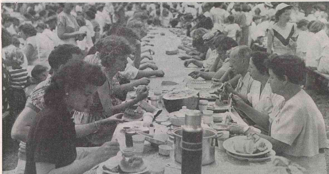
Several enjoyed their lunch and Bingo at the same time.