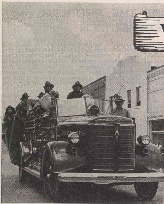
The modern equipment and firemen are as near as your telephone when you need them.

Have you ever tried to decide which group of people in the community is the most essential to its welfare—which group you'd miss most if they moved away?