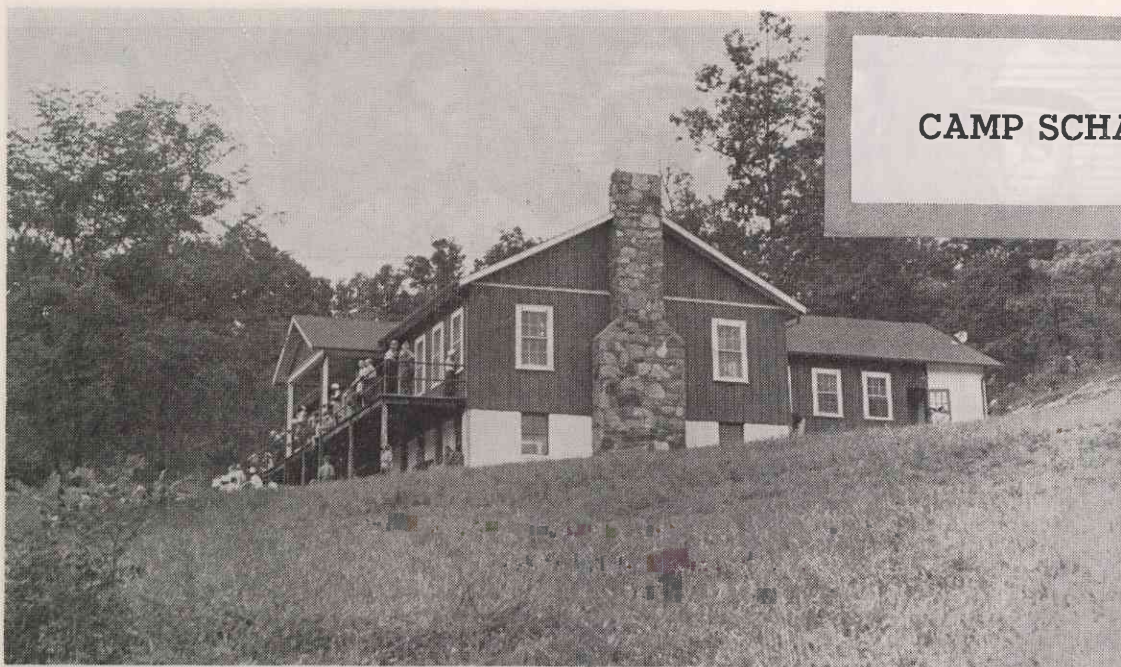
Above; The Main Building. Below; The Mountain Experiment Station and on the facing page, lower right; The Transylvania Cottage.